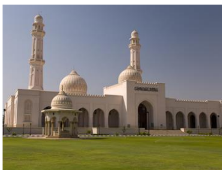
Sultan Qaboos Mosque, Salalah

The Rotana Hotel Resort, where the conference is held, is offering a special package for 50 OMR (130$) a day including lodging and 2 meals (breakfast and dinner). Please click here for the reservation form.