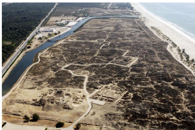
AL Baleed Archaeological Site

The Rotana Hotel Resort offers a special package for our conference delegates including lodging and 2 meals (breakfast and dinner) a day for 50 OMR ($130) per day. This package can be booked directly at the hotel via this booking form .