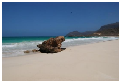
Beach Salalah.